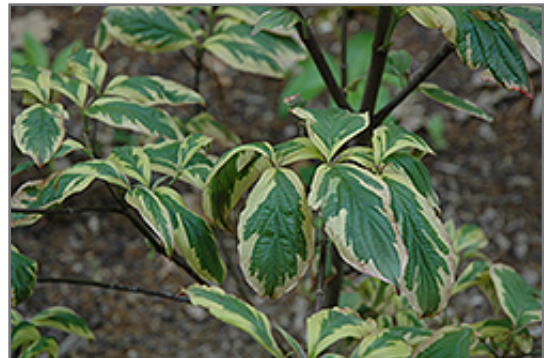
Firebird Flowering Dogwood foliage

Firebird Flowering Dogwood is recommended for the following landscape applications;