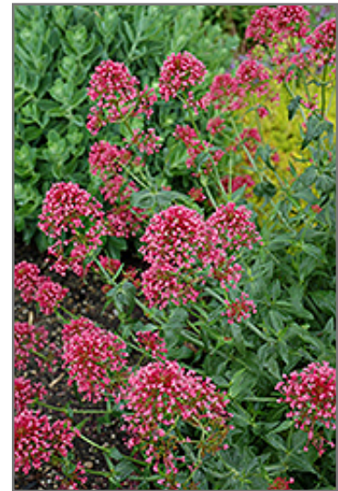
Red Valerian flowers

Red Valerian is recommended for the following landscape applications;