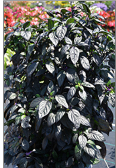
Black Pearl Ornamental Pepper