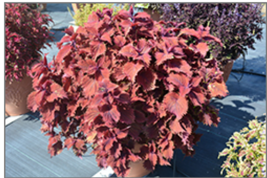
Under The Sea King Crab Coleus