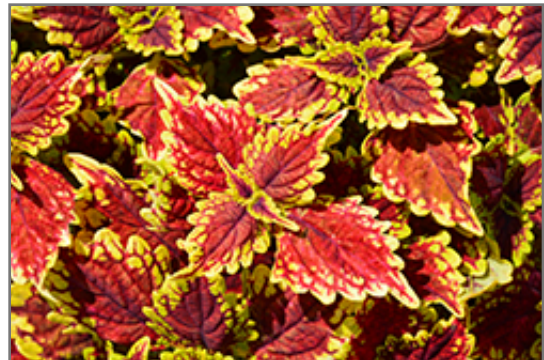
Oxford Street Coleus foliage