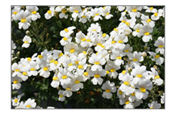
Sunsatia Coconut Nemesia flowers

Hardiness Zone: (annual) Group/Class: Sunsatia Series