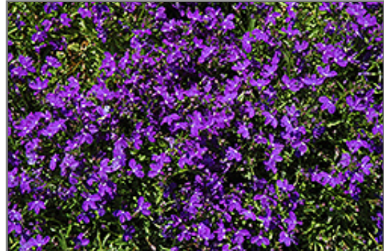
Magadi Basket Dark Blue Lobelia flowers

Magadi Basket Dark Blue Lobelia will grow to be about 10 inches tall at maturity, with a spread of 10 inches. When grown in masses or used as a bedding plant, individual plants should be spaced approximately 8 inches apart. Its foliage tends to remain low and dense right to the ground. Although it's not a true annual, this fast-growing plant can be expected to behave as an annual in our climate if left outdoors over the winter, usually needing replacement the following year. As such, gardeners should take into consideration that it will perform differently than it would in its native habitat.