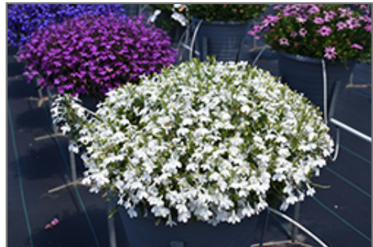
Techno Upright White Lobelia in bloom

Techno Upright White Lobelia will grow to be about 10 inches tall at maturity, with a spread of 12 inches. When grown in masses or used as a bedding plant, individual plants should be spaced approximately 10 inches apart. Its foliage tends to remain low and dense right to the ground. Although it's not a true annual, this fast-growing plant can be expected to behave as an annual in our climate if left outdoors over the winter, usually needing replacement the following year. As such, gardeners should take into consideration that it will perform differently than it would in its native habitat.