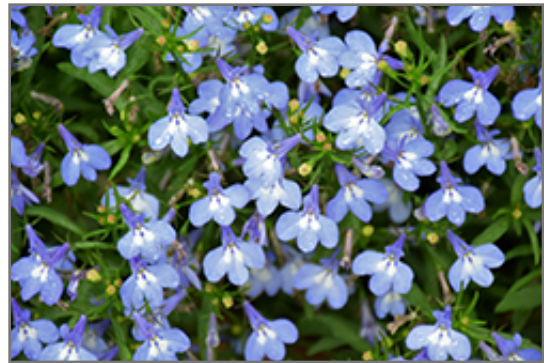
Techno Upright Light Blue Lobelia flowers

Techno Upright Light Blue Lobelia is recommended for the following landscape applications;