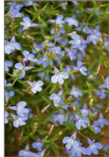
Techno Light Blue Lobelia flowers

Techno Light Blue Lobelia will grow to be about 8 inches tall at maturity, with a spread of 12 inches. When grown in masses or used as a bedding plant, individual plants should be spaced approximately 10 inches apart. Its foliage tends to remain low and dense right to the ground. Although it's not a true annual, this fast-growing plant can be expected to behave as an annual in our climate if left outdoors over the winter, usually needing replacement the following year. As such, gardeners should take into consideration that it will perform differently than it would in its native habitat.