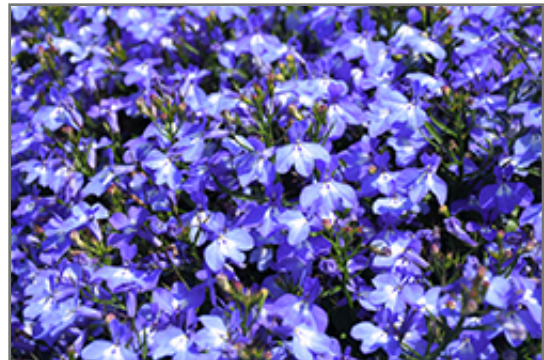
Techno Light Blue Lobelia flowers

Techno Light Blue Lobelia is recommended for the following landscape applications;