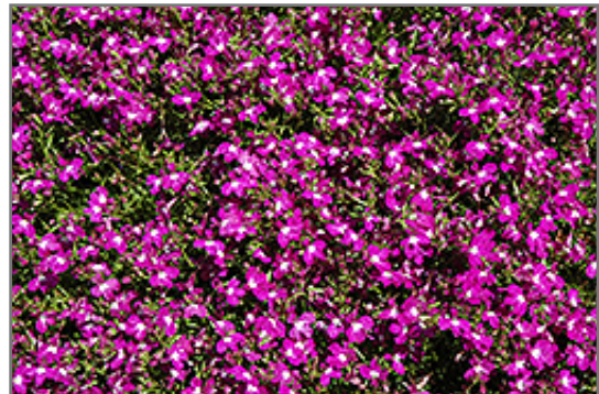
Magadi Electric Purple Lobelia flowers

Magadi Electric Purple Lobelia will grow to be about 10 inches tall at maturity, with a spread of 10 inches. When grown in masses or used as a bedding plant, individual plants should be spaced approximately 8 inches apart. Its foliage tends to remain low and dense right to the ground. Although it's not a true annual, this fast-growing plant can be expected to behave as an annual in our climate if left outdoors over the winter, usually needing replacement the following year. As such, gardeners should take into consideration that it will perform differently than it would in its native habitat.