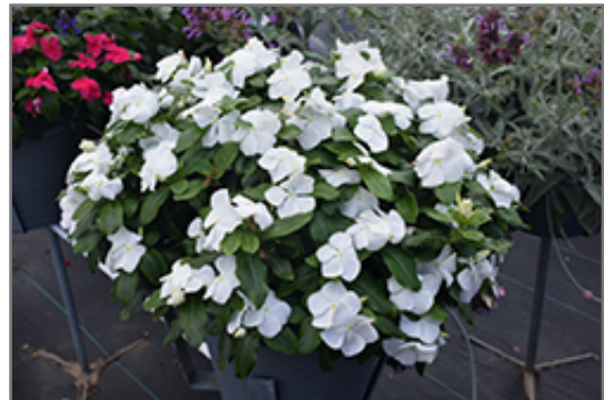
Titan Pure White Vinca in bloom

Titan Pure White Vinca will grow to be about 14 inches tall at maturity, with a spread of 12 inches. Its foliage tends to remain dense right to the ground, not requiring facer plants in front. Although it's not a true annual, this fast-growing plant can be expected to behave as an annual in our climate if left outdoors over the winter, usually needing replacement the following year. As such, gardeners should take into consideration that it will perform differently than it would in its native habitat.