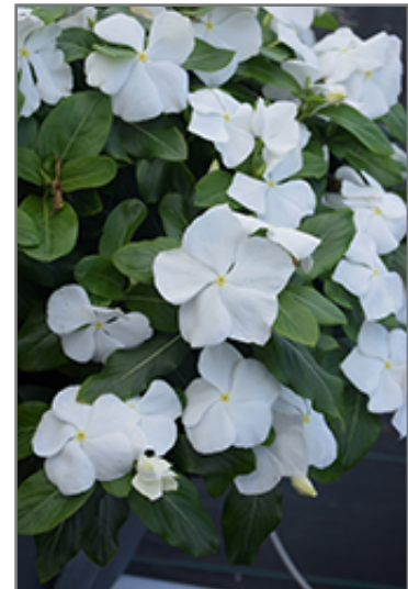
Titan Pure White Vinca flowers

Titan Pure White Vinca is recommended for the following landscape applications;