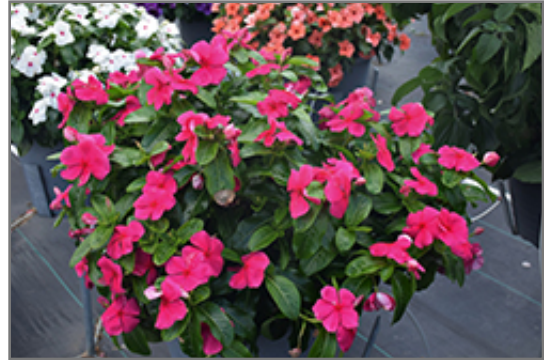
Titan Punch Vinca in bloom

Titan Punch Vinca will grow to be about 14 inches tall at maturity, with a spread of 12 inches. Its foliage tends to remain dense right to the ground, not requiring facer plants in front. Although it's not a true annual, this fast-growing plant can be expected to behave as an annual in our climate if left outdoors over the winter, usually needing replacement the following year. As such, gardeners should take into consideration that it will perform differently than it would in its native habitat.