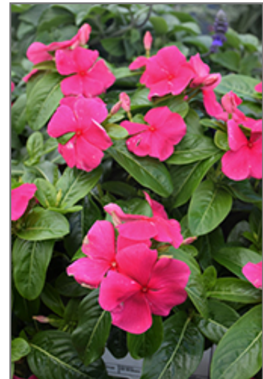
Titan Punch Vinca flowers

Titan Punch Vinca is recommended for the following landscape applications;