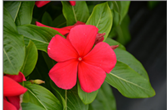
Titan Dark Red Vinca flowers

Titan Dark Red Vinca is recommended for the following landscape applications;