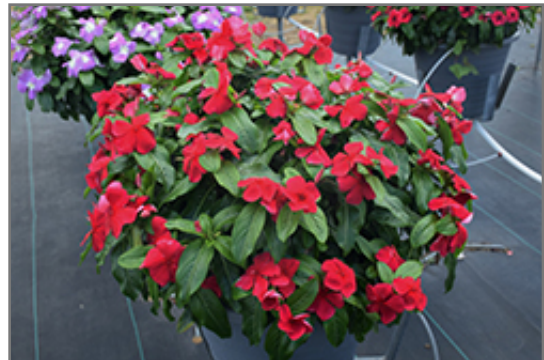
Titan Dark Red Vinca in bloom

Titan Dark Red Vinca will grow to be about 14 inches tall at maturity, with a spread of 12 inches. Its foliage tends to remain dense right to the ground, not requiring facer plants in front. Although it's not a true annual, this fast-growing plant can be expected to behave as an annual in our climate if left outdoors over the winter, usually needing replacement the following year. As such, gardeners should take into consideration that it will perform differently than it would in its native habitat.