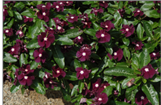
Jams 'N Jellies Blackberry Vinca flowers

Jams 'N Jellies Blackberry Vinca is recommended for the following landscape applications;