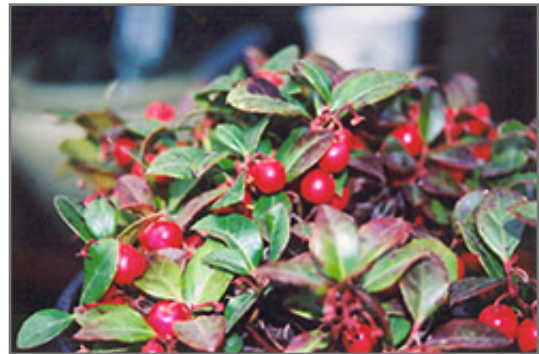
Creeping Wintergreen fruit

Creeping Wintergreen is recommended for the following landscape applications;