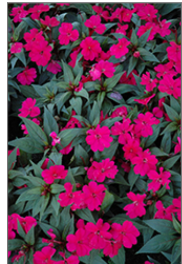
SunPatens Compact Royal Magenta New Guinea Impatiens flowers