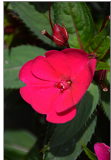
SunPatens Compact Royal Magenta New Guinea Impatiens flowers

This plant will require occasional maintenance and upkeep, and should not require much pruning, except when necessary, such as to remove dieback. It is a good choice for attracting bees and butterflies to your yard. It has no significant negative characteristics.