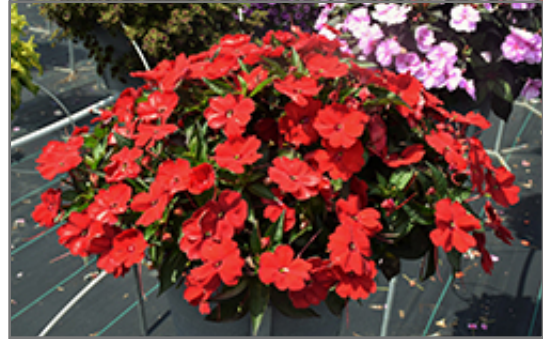
SunPatiens Compact Red New Guinea Impatiens in bloom

SunPatiens Compact Red New Guinea Impatiens is a fine choice for the garden, but it is also a good selection for planting in outdoor containers and hanging baskets. It can be used either as 'filler' or as a 'thriller' in the 'spiller-thriller-filler' container combination, depending on the height and form of the other plants used in the container planting. It is even sizeable enough that it can be grown alone in a suitable container. Note that when growing plants in outdoor containers and baskets, they may require more frequent waterings than they would in the yard or garden.