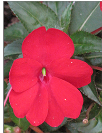
SunPatens Compact Red New Guinea Impatiens flowers

This plant will require occasional maintenance and upkeep, and should not require much pruning, except when necessary, such as to remove dieback. It is a good choice for attracting bees and butterflies to your yard. It has no significant negative characteristics.