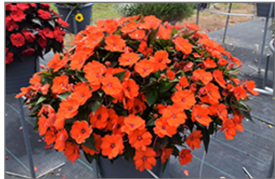
SunPatiens Compact Electric Orange New Guinea Impatiens in bloom

SunPatiens Compact Electric Orange New Guinea Impatiens is a fine choice for the garden, but it is also a good selection for planting in outdoor containers and hanging baskets. It can be used either as 'filler' or as a 'thriller' in the 'spiller-thriller-filler' container combination, depending on the height and form of the other plants used in the container planting. It is even sizeable enough that it can be grown alone in a suitable container. Note that when growing plants in outdoor containers and baskets, they may require more frequent waterings than they would in the yard or garden.