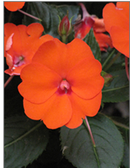
SunPatens Compact Electric Orange New Guinea Impatiens flowers

This plant will require occasional maintenance and upkeep, and should not require much pruning, except when necessary, such as to remove dieback. It is a good choice for attracting bees and butterflies to your yard. It has no significant negative characteristics.