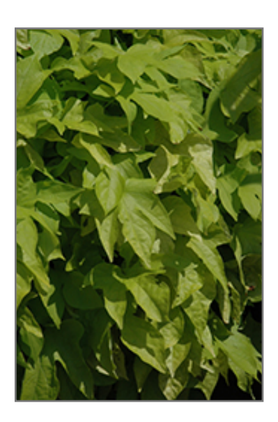
Bright Ideas Lime Sweet Potato Vine foliage

Bright Ideas Lime Sweet Potato Vine is a dense herbaceous annual with a trailing habit of growth, eventually spilling over the edges of hanging baskets and containers. Its relatively fine texture sets it apart from other garden plants with less refined foliage.