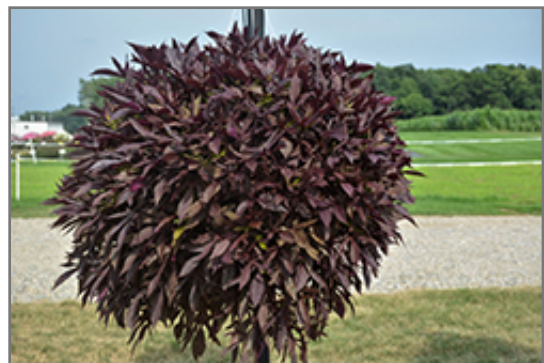
Illusion Garnet Lace Sweet Potato Vine