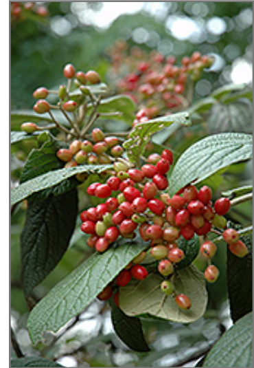
Alleghany Viburnum fruit

This shrub does best in full sun to partial shade. It prefers to grow in average to moist conditions, and shouldn't be allowed to dry out. It is not particular as to soil type or pH. It is highly tolerant of urban pollution and will even thrive in inner city environments. This particular variety is an interspecific hybrid.