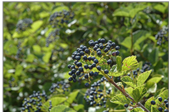
Chicago Lustre Viburnum fruit