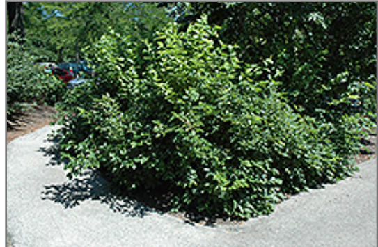
Chicago Lustre Viburnum

This shrub does best in full sun to partial shade. It prefers to grow in average to moist conditions, and shouldn't be allowed to dry out. It is not particular as to soil type or pH. It is highly tolerant of urban pollution and will even thrive in inner city environments. This is a selection of a native North American species.