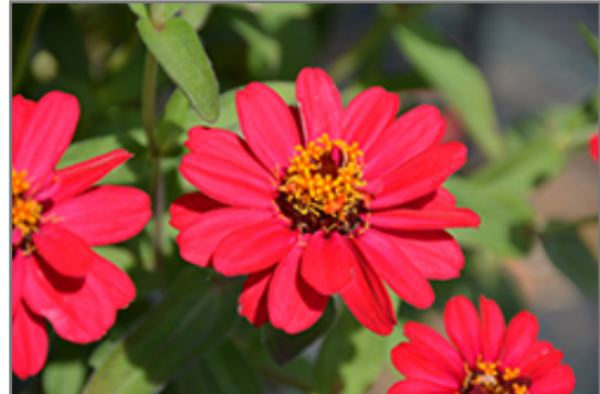
Profusion Double Hot Cherry Zinnia flowers