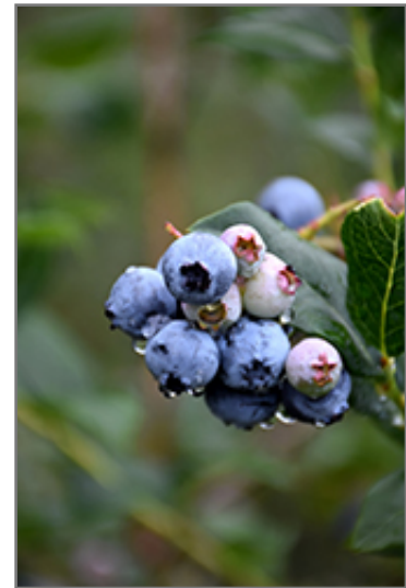
Chippewa Blueberry fruit

Chippewa Blueberry features dainty clusters of white bell-shaped flowers with shell pink overtones hanging below the branches in mid spring. It has green foliage throughout the season. The glossy oval leaves turn an outstanding orange in the fall. It features an abundance of magnificent blue berries in mid summer.