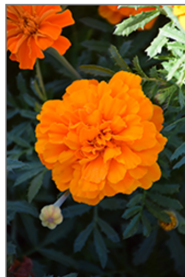
Safari Tangerine Marigold flowers