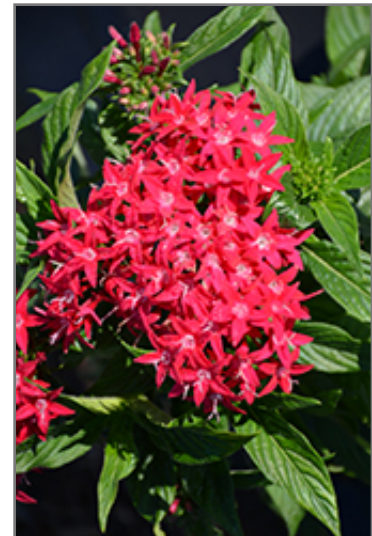
Graffiti OG Lipstick Star Flower flowers

Graffiti OG Lipstick Star Flower is recommended for the following landscape applications;