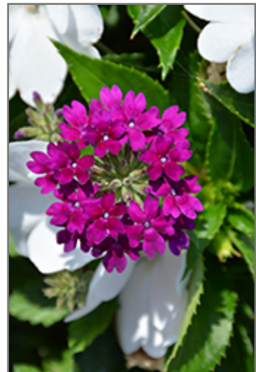
Superbena Royale Plum Wine Verbena flowers