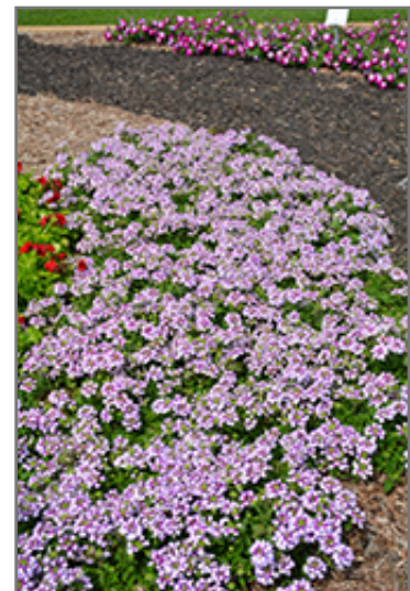
Lanai Twister Purple Verbena in bloom