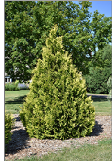
Yellow Ribbon Arborvitae