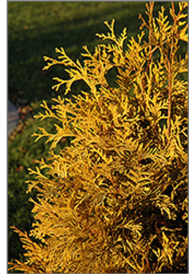
Yellow Ribbon Arborvitae in fall

This shrub does best in full sun to partial shade. It prefers to grow in average to moist conditions, and shouldn't be allowed to dry out. It is not particular as to soil type or pH. It is somewhat tolerant of urban pollution, and will benefit from being planted in a relatively sheltered location. Consider applying a thick mulch around the root zone in winter to protect it in exposed locations or colder microclimates. This is a selection of a native North American species.