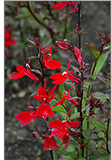
Fan Scarlet Cardinal Flower flowers