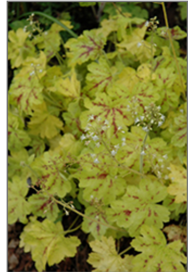
Solar Power Foamy Bells flowers