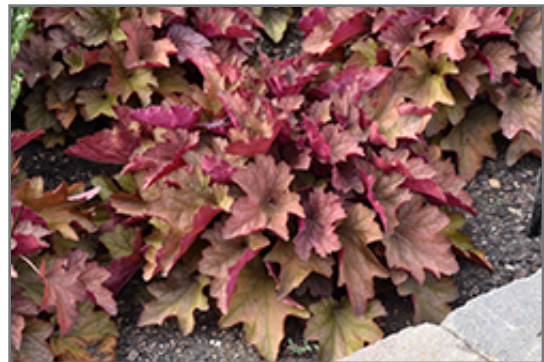
Carnival Watermelon Coral Bells