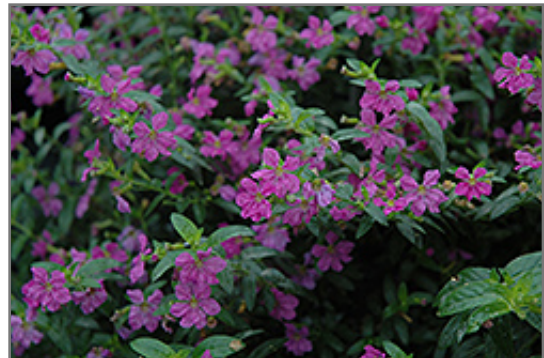
Allyson Mexican Heather flowers