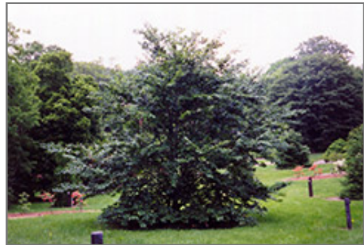
American Beech