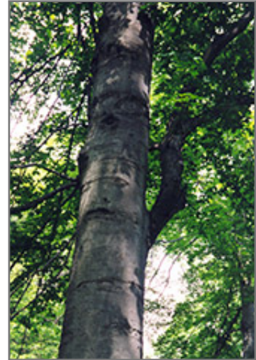
American Beech bark

This tree should only be grown in full sunlight. It requires an evenly moist well-drained soil for optimal growth, but will die in standing water. It is not particular as to soil pH, but grows best in rich soils. It is quite intolerant of urban pollution, therefore inner city or urban streetside plantings are best avoided, and will benefit from being planted in a relatively sheltered location. This species is native to parts of North America.