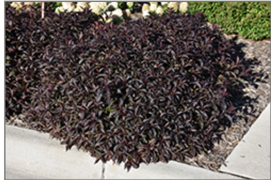
Spilled Wine Weigela