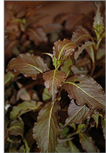
Spilled Wine Weigela foliage

Spilled Wine Weigela makes a fine choice for the outdoor landscape, but it is also well-suited for use in outdoor pots and containers. Because of its height, it is often used as a 'thriller' in the 'spiller-thriller-filler' container combination; plant it near the center of the pot, surrounded by smaller plants and those that spill over the edges. It is even sizeable enough that it can be grown alone in a suitable container. Note that when grown in a container, it may not perform exactly as indicated on the tag - this is to be expected. Also note that when growing plants in outdoor containers and baskets, they may require more frequent waterings than they would in the yard or garden.