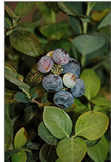
Peach Sorbet Blueberry fruit

Peach Sorbet Blueberry features dainty clusters of white bell-shaped flowers hanging below the branches in mid spring. It has green evergreen foliage. The glossy oval leaves turn an outstanding deep purple in the fall, which persists throughout the winter. It features an abundance of magnificent blue berries from early to mid summer.