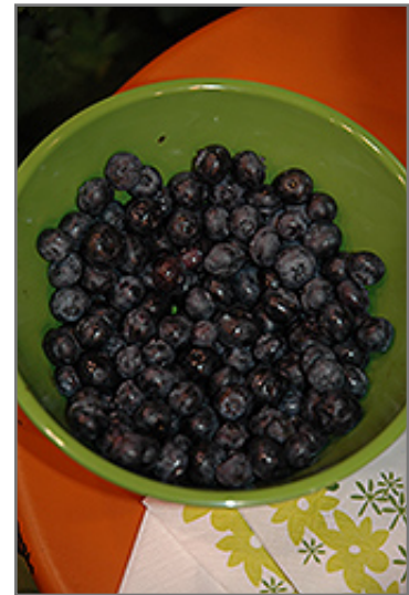
Peach Sorbet Blueberry fruit

This shrub is quite ornamental as well as edible, and is as much at home in a landscape or flower garden as it is in a designated edibles garden. It does best in full sun to partial shade. It does best in average to evenly moist conditions, but will not tolerate standing water. It is very fussy about its soil conditions and must have sandy, acidic soils to ensure success, and is subject to chlorosis (yellowing) of the foliage in alkaline soils. It is quite intolerant of urban pollution, therefore inner city or urban streetside plantings are best avoided, and will benefit from being planted in a relatively sheltered location. Consider applying a thick mulch around the root zone in winter to protect it in exposed locations or colder microclimates. This particular variety is an interspecific hybrid.