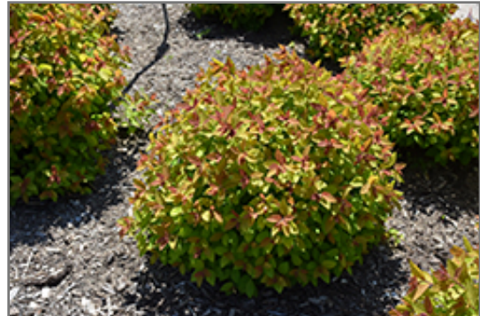
Double Play Big Bang Spirea