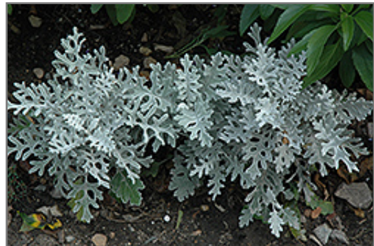
Silver Dust Dusty Miller foliage