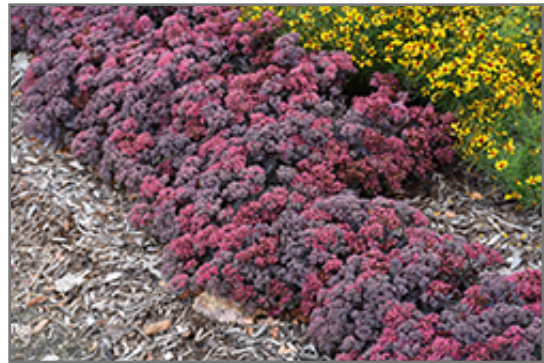
Dazzleberry Stonecrop in bloom