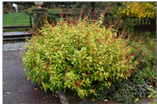
Golden Delicious Pineapple Sage in bloom