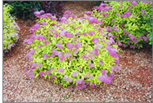
Goldmound Spirea in bloom

This shrub should only be grown in full sunlight. It prefers to grow in average to moist conditions, and shouldn't be allowed to dry out. It is not particular as to soil type or pH. It is highly tolerant of urban pollution and will even thrive in inner city environments. This is a selected variety of a species not originally from North America.