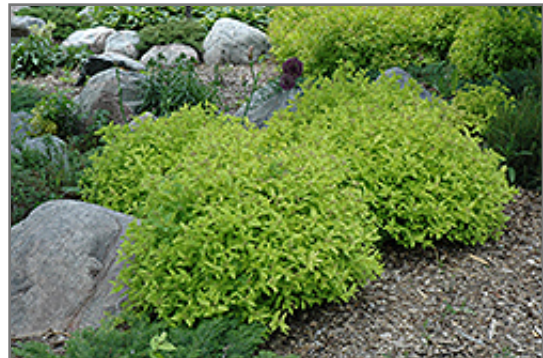
Goldmound Spirea