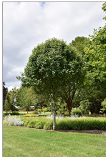
Jack Ornamental Pear

This tree should only be grown in full sunlight. It prefers to grow in average to moist conditions, and shouldn't be allowed to dry out. It is not particular as to soil type or pH. It is highly tolerant of urban pollution and will even thrive in inner city environments. This is a selected variety of a species not originally from North America.