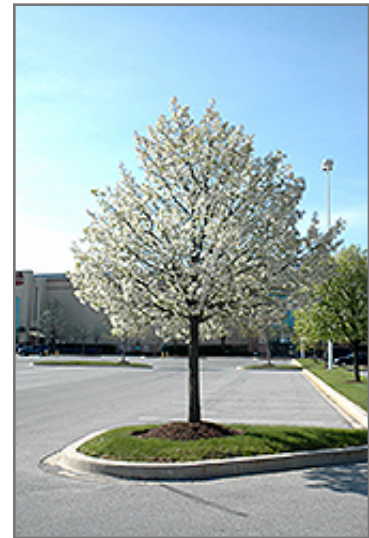
Jack Ornamental Pear in bloom