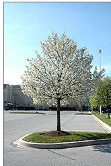
Jack Ornamental Pear in bloom