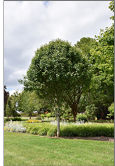
Jack Ornamental Pear

This tree should only be grown in full sunlight. It prefers to grow in average to moist conditions, and shouldn't be allowed to dry out. It is not particular as to soil type or pH. It is highly tolerant of urban pollution and will even thrive in inner city environments. This is a selected variety of a species not originally from North America.