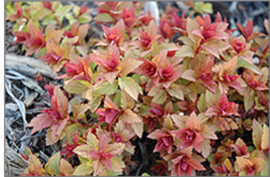
Magic Carpet Spirea foliage

This shrub should only be grown in full sunlight. It prefers to grow in average to moist conditions, and shouldn't be allowed to dry out. It is not particular as to soil type or pH. It is highly tolerant of urban pollution and will even thrive in inner city environments. This particular variety is an interspecific hybrid.