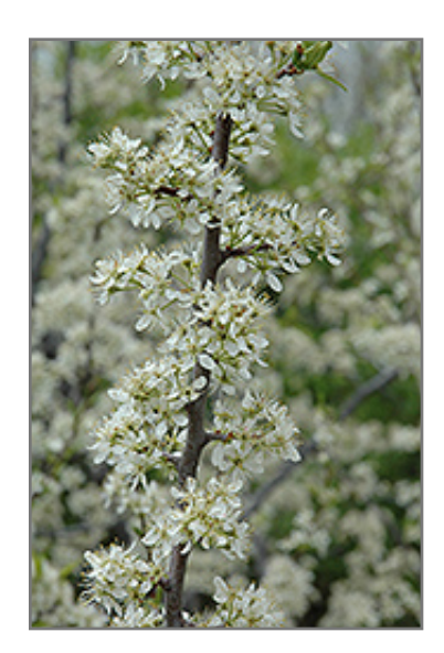
Santa Rosa Plum flowers