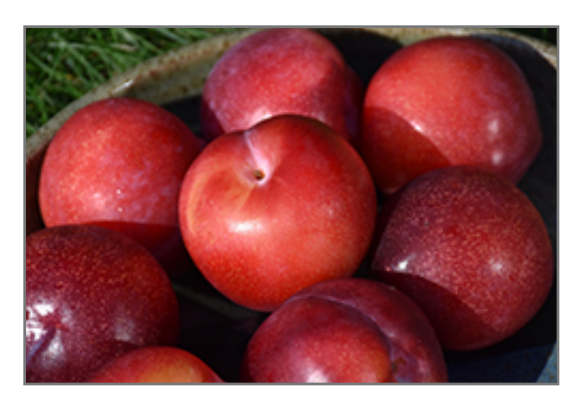
Santa Rosa Plum fruit

Santa Rosa Plum is smothered in stunning clusters of fragrant white flowers along the branches in early spring before the leaves. It has forest green deciduous foliage. The pointy leaves turn yellow in fall. The fruits are showy crimson drupes carried in abundance in late summer. The fruit can be messy if allowed to drop on the lawn or walkways, and may require occasional clean-up.