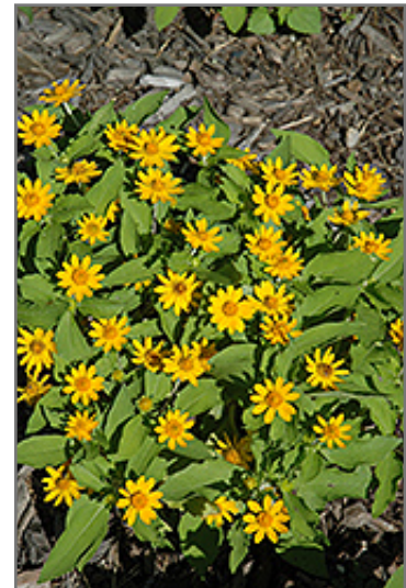
Million Gold Melampodium flowers