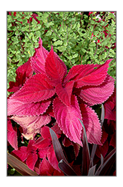
Hot Lava Coleus foliage

Hot Lava Coleus will grow to be about 18 inches tall at maturity, with a spread of 14 inches. When grown in masses or used as a bedding plant, individual plants should be spaced approximately 10 inches apart. Although it's not a true annual, this fast-growing plant can be expected to behave as an annual in our climate if left outdoors over the winter, usually needing replacement the following year. As such, gardeners should take into consideration that it will perform differently than it would in its native habitat.