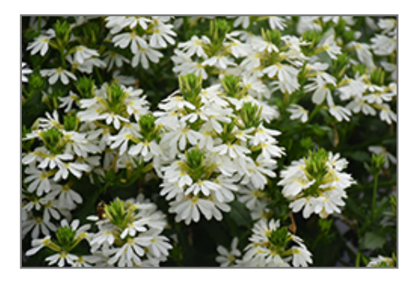
Whirlwind White Fan Flower flowers

Whirlwind White Fan Flower is an herbaceous annual with a trailing habit of growth, eventually spilling over the edges of hanging baskets and containers. Its relatively fine texture sets it apart from other garden plants with less refined foliage.