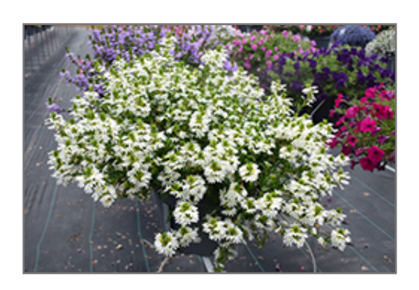
Whirlwind White Fan Flower in bloom

This plant will require occasional maintenance and upkeep. Trim off the flower heads after they fade and die to encourage more blooms late into the season. It has no significant negative characteristics.