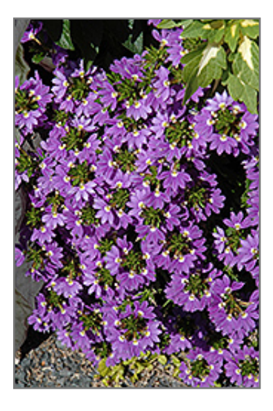
Blue Wonder Fan Flower flowers

Blue Wonder Fan Flower features dainty lavender flowers along the stems from mid spring to late summer. Its small serrated oval leaves remain dark green in color throughout the season.