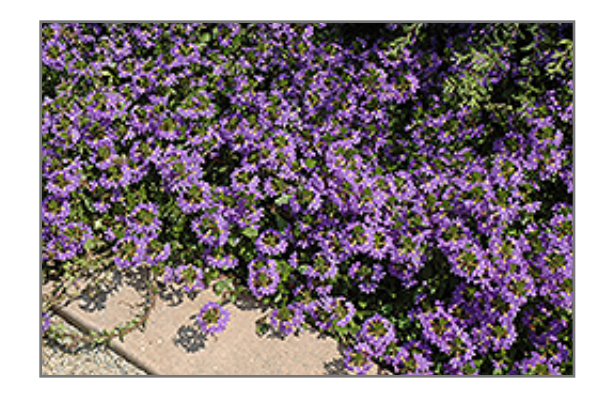
Blue Fan Fan Flower flowers

Hardiness Zone: (annual) Group/Class: Blue Series